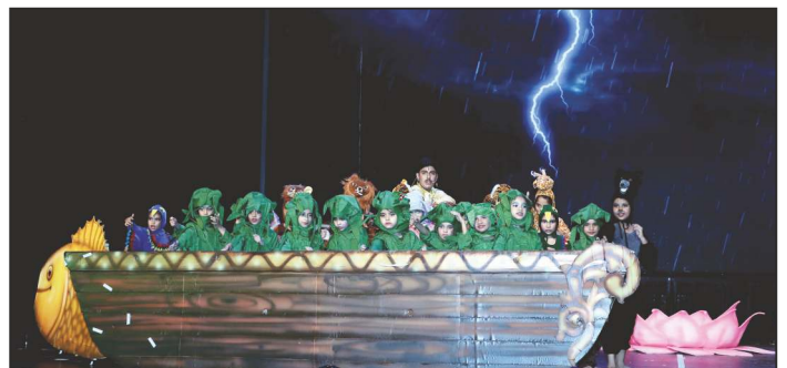
Crafting Character, Telling Tale