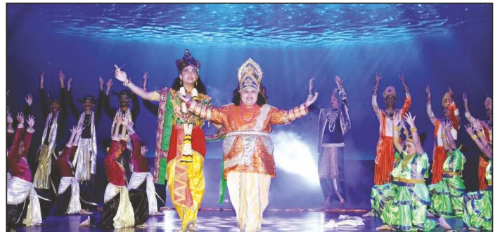
Kurma - The Preserver of the Cosmic Order