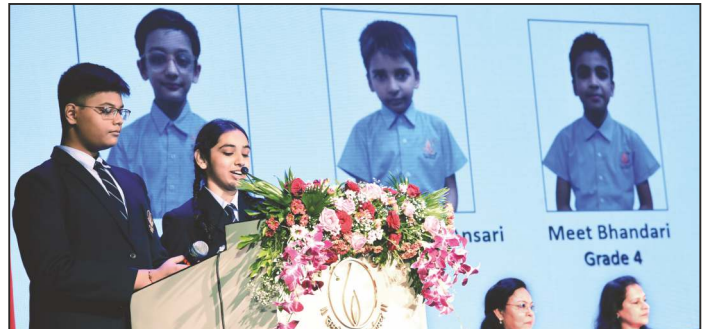
Our Student Ambassadors