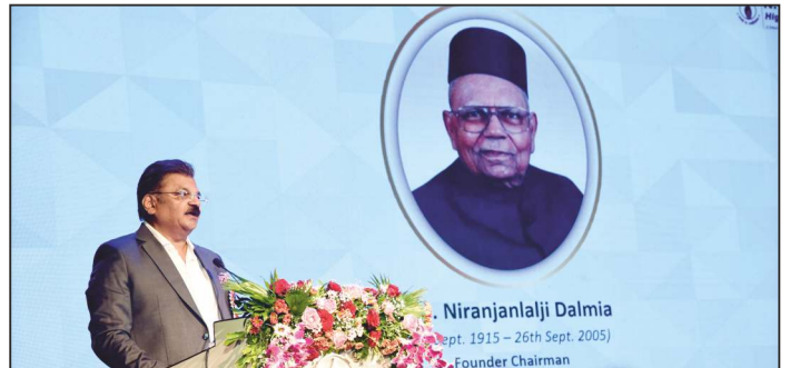
Hon. Secretary's Address