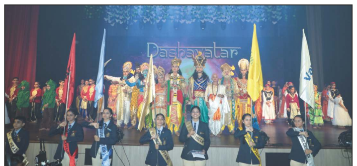
Attitude of Gratitude