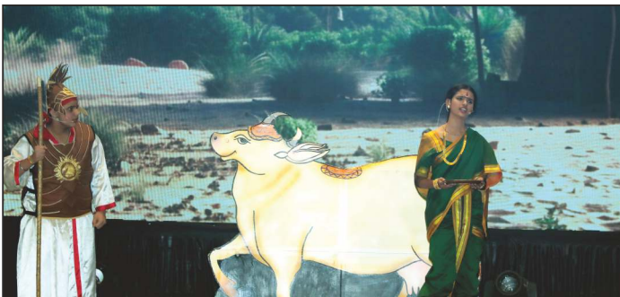
Unleashing the Inner Actor