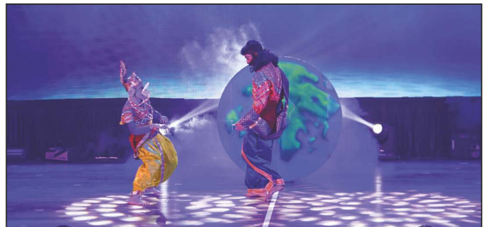
A Theatrical Extravaganza