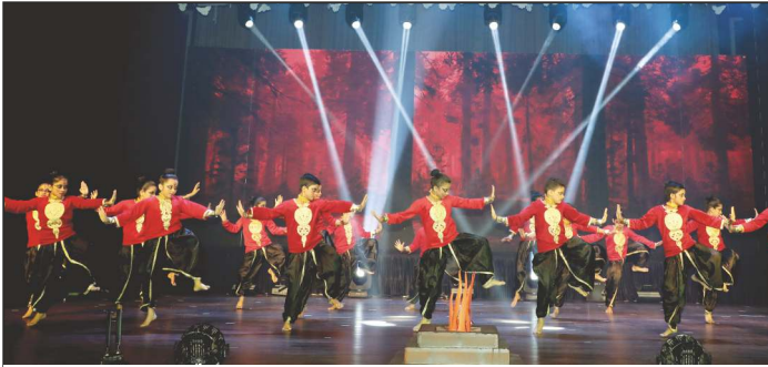
The Perfect Canvas