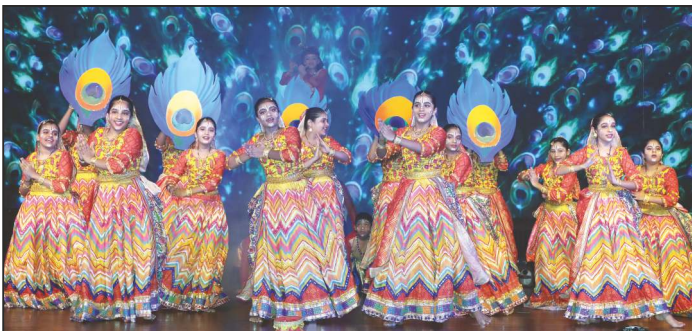
A Burst of Energy and Passion