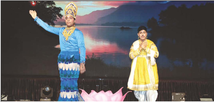
The Inception - Mastya Avatar