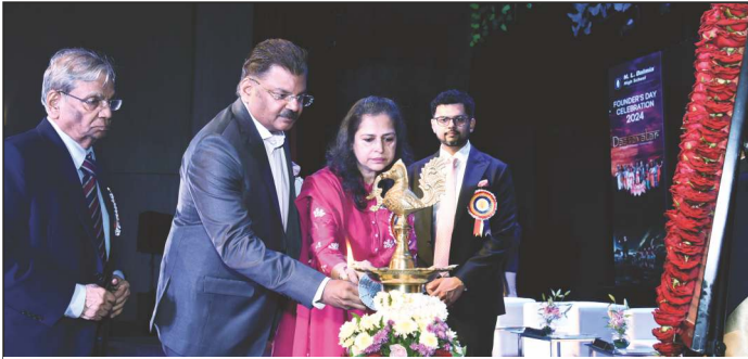
Lighting the Ceremonial Lamp