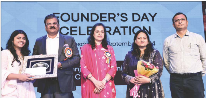
Hard Work turns 'Dreams into Reality'