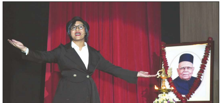
The Charismatic Storyteller