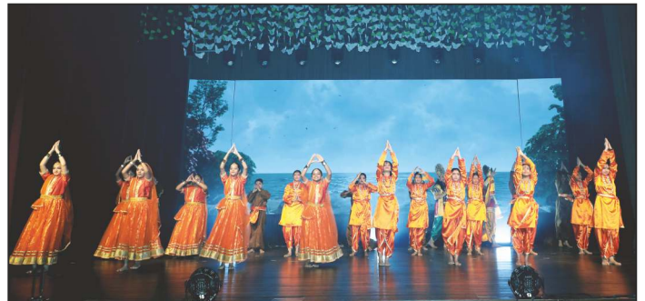
The Vibrant Performers