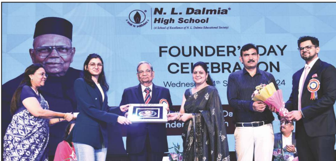
Felicitating the ISC Achiever