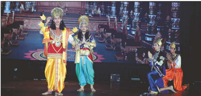
Embodiment of Virtue and Honour - 'Lord Ram'