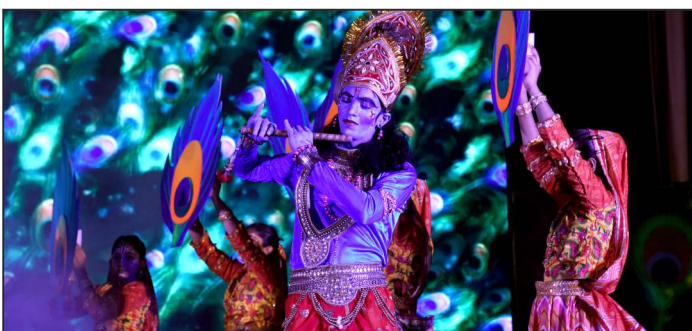
Truly Blissful and Enchanting