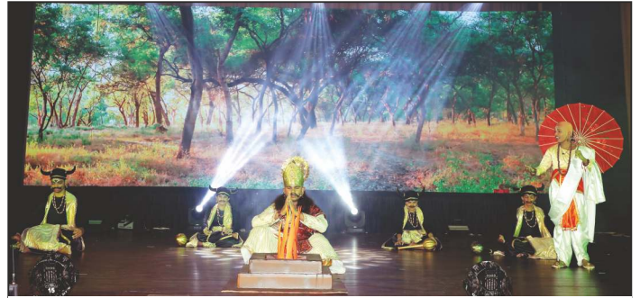
Stepping into the Epitome