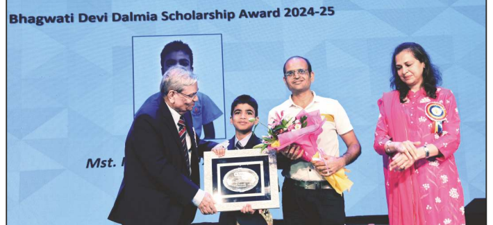
The Epitome of Excellence