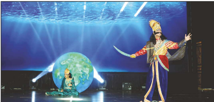
Captivating the Audience