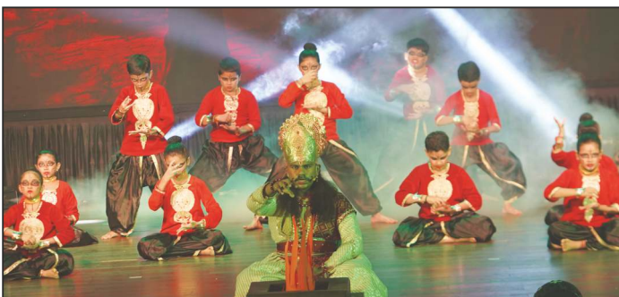
Passion to Precision