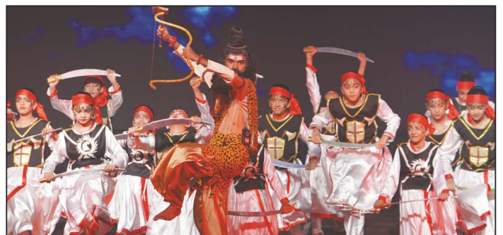
The Powerful Parshuram Performance