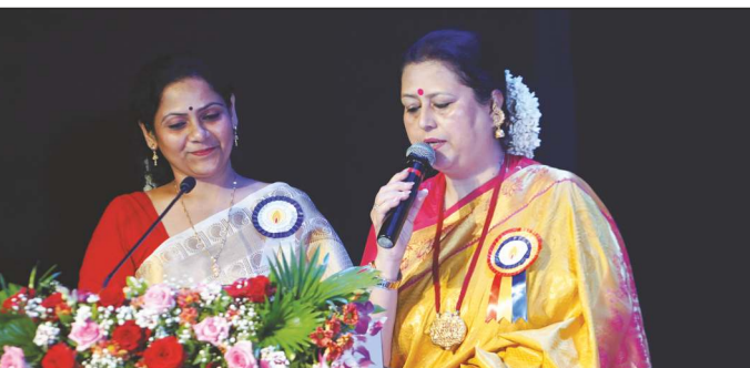
The Coherent Anchors