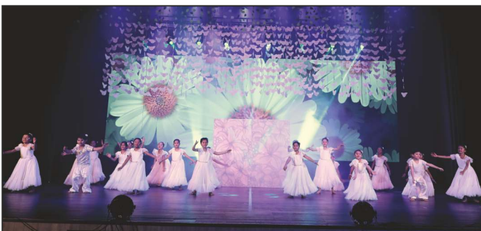
The Little Angels