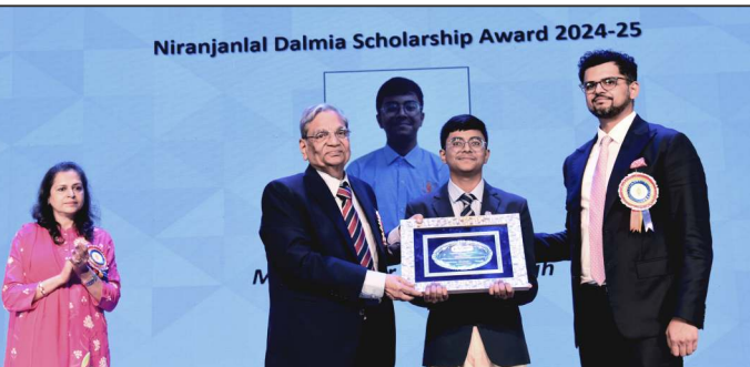
The Recipient of 'Niranjanlal Dalmia Scholarship Award'