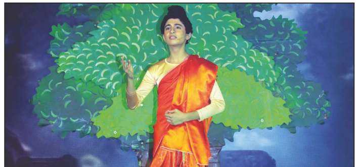
The Epitome of Tranquility