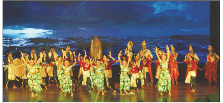
When the Stage Comes Alive