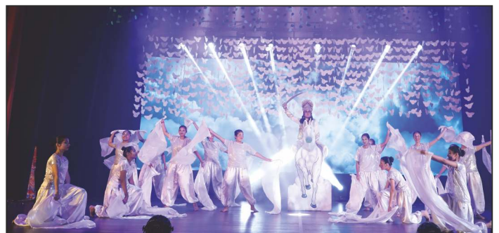
Peace at it's Peak