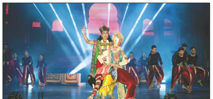
At the Pinnacle of Glory