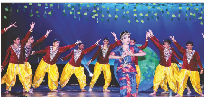
Artistry in Every Gesture