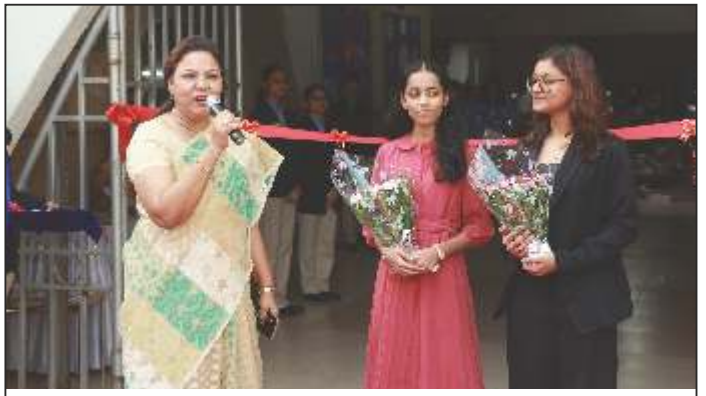
A Floral Greeting to School Toppers as Chief Guests