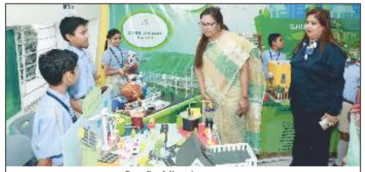
Our Budding Innovators