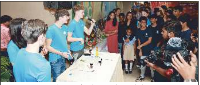
Exchange of Culture and Knowledge