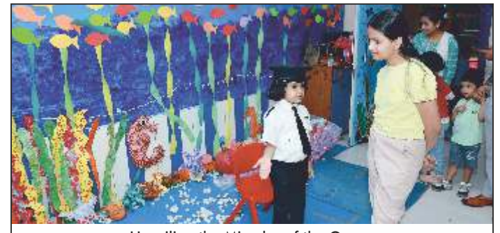
Unveiling the Miracles of the Ocean