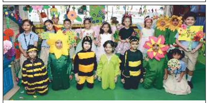
Attitude of Gratitude