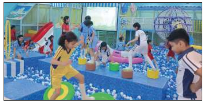
Grade IV - Field Trip - Kidzania

The students of Grade II went on a Field Trip to 'Tic Tac Tot' and "Bird Sanctuary" to develop various competing skills like spatial reasoning, hand-eye coordination and strategizing. Students were also taken to Bird Park where they enjoyed together knowledge about different birds. Thrill and excitement were seen as they expressed their observations.