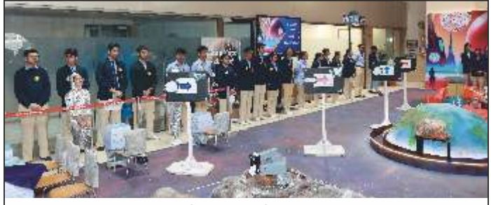
Kick Starting the Event