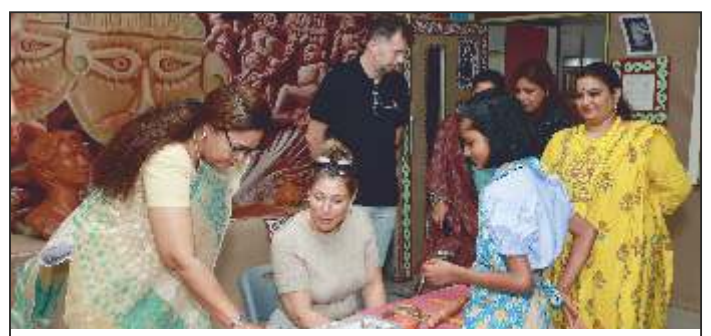
Hands on Experience