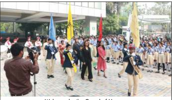
Welcome by the Guard of Honour