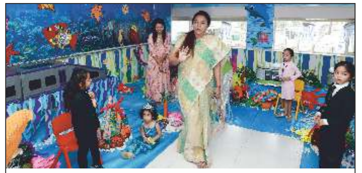
Little Minds Big Dreams