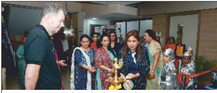
Lighting the Ceremonial Lamp