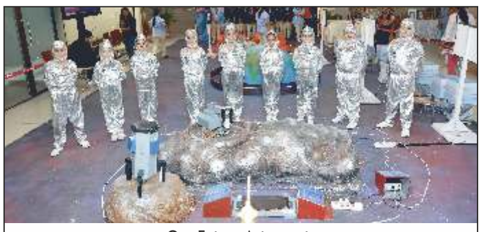
Our Future Astronauts