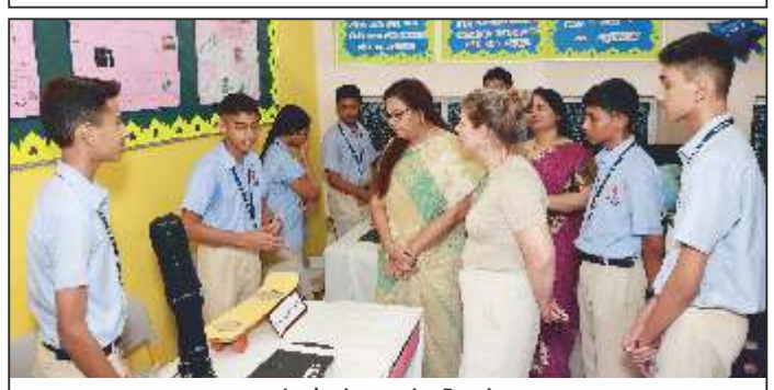
Inclusion at its Best!