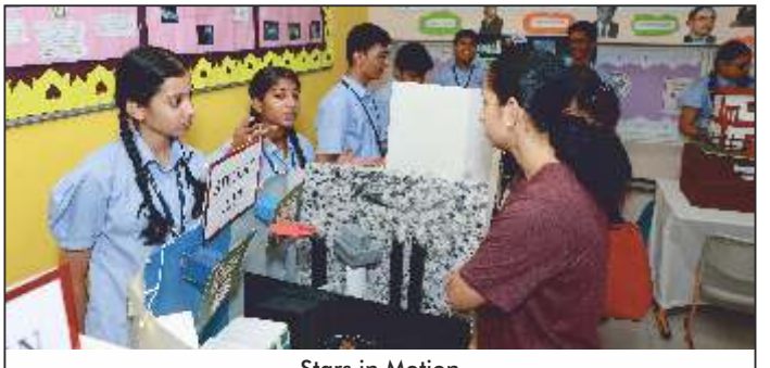
Stars in Motion