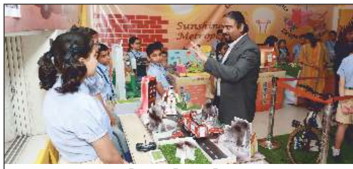
From an Expert's Eye