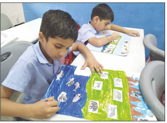
Grade III - Fun with Geometry Shapes

The 'Convivial Learning Program' was conducted with an objective to encourage complete activity-based learning. The E.V.S. Activity - 'Classification of Animals' Habitats' was conducted in a creative way wherein the students were able to differentiate different species of animals. To develop confidence, English speaking activity was conducted. To develop fine motor skills, Cotton Pasting Activity was organized which thrilled the students as they learnt to colour different animals. The Bindi Pasting Activity was a great way to encourage and develop creativity and imagination of the students.