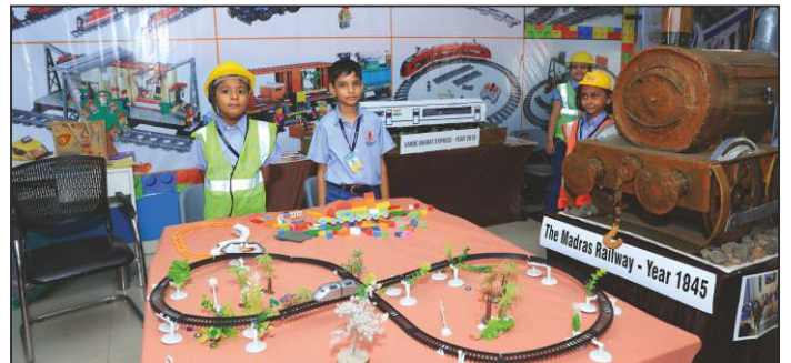
The Journey of Railways - India