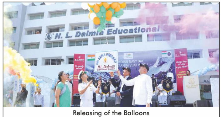
Releasing of the Balloons