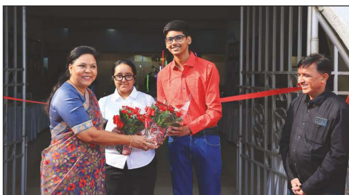
A Floral Greeting