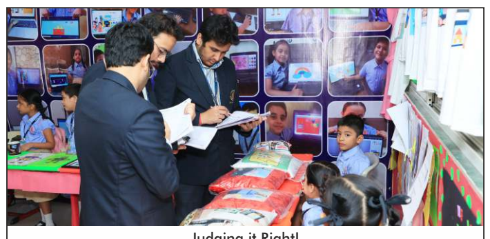
Judging it Right!