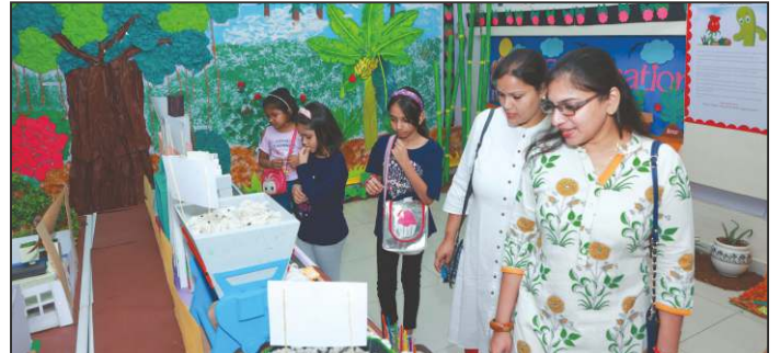
Watching the Greens