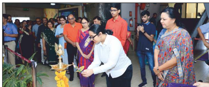
Lighting the Ceremonial Lamp