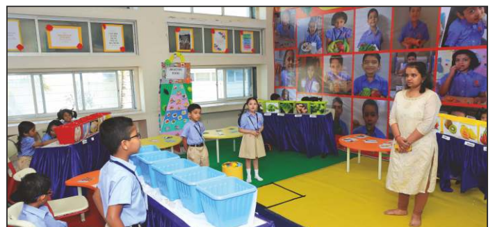
Games are Fun!