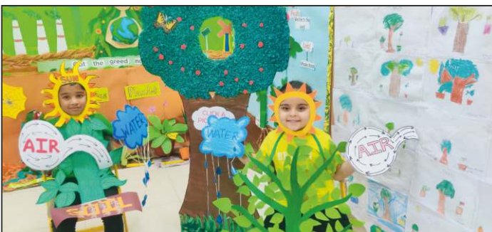
All About Plants