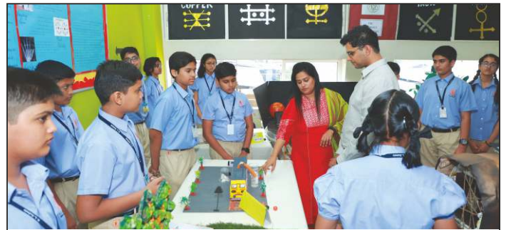
The Miracle Workers

With a footfall of nearly 10,000, Nirmaan Exhibition was truly a success. It provided a platform for the students to use their scientific knowledge and bring the best invention from their brains. The synthesis of ideas and galvanising those ideas to bring something innovative into implementation is the main aim of the exhibition. Science begins with wonder, scientific temperament and rational thinking. This Nirmaan exhibition made our students more confident, creative, future-ready and learners for life.