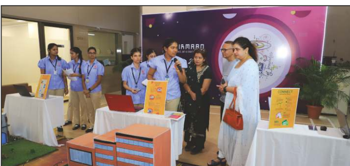
Eminent Doctors Appreciating Exhibits