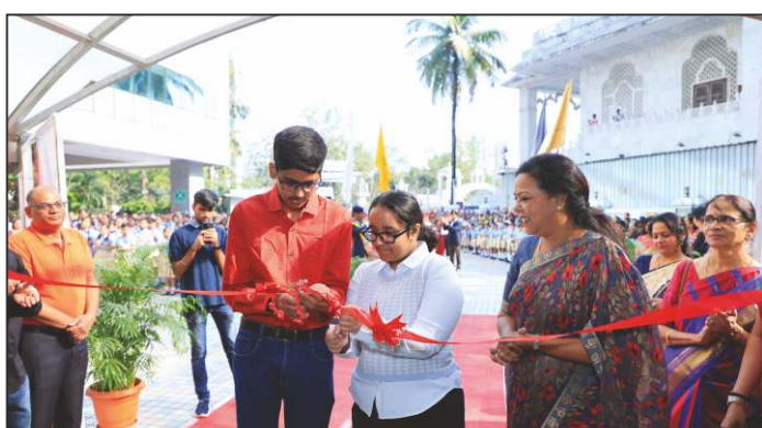
Inauguration by the Chief Guests