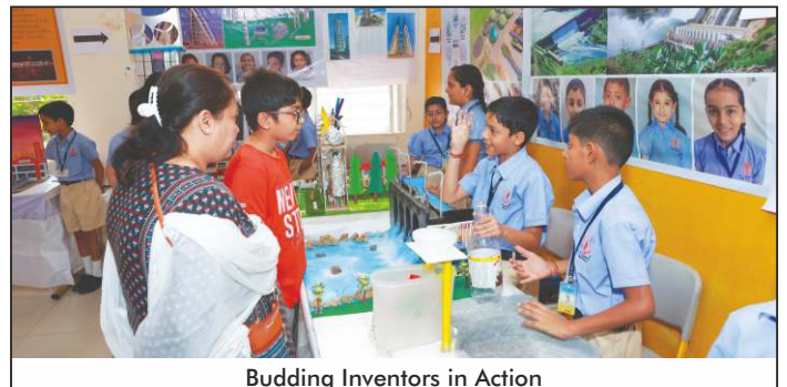
Budding Inventors in Action