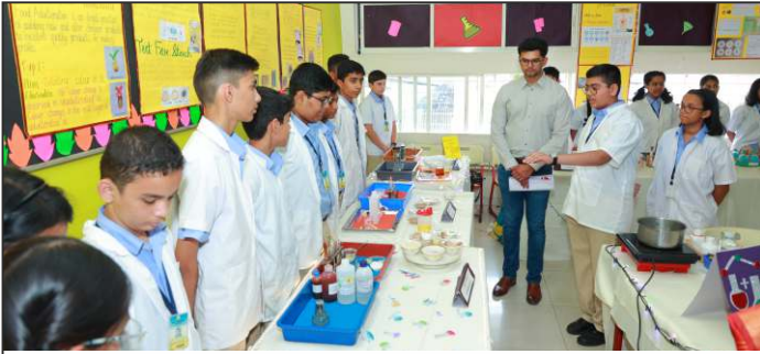
The Element of Surprise