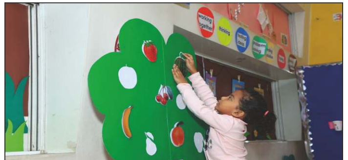
Hands on Learning