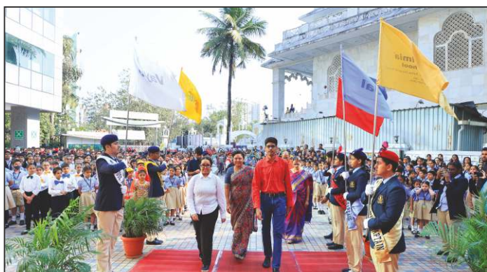
Welcome by the Guard of Honour