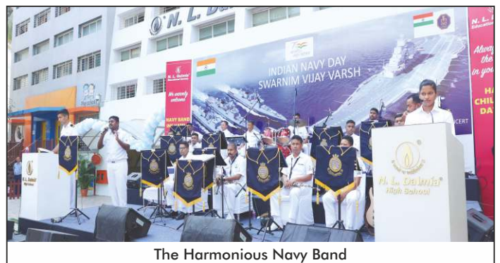
The Harmonious Navy Band