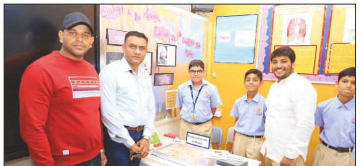
Alumni's Visit to the Exhibits