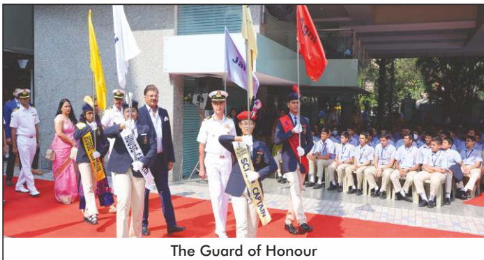
The Guard of Honour

'The most precious thing in the world is the smile, the innocence, the purity that a child holds and what better way to celebrate this trinity than to witness a soulful symphony by the INS Hamla Navy Band, on Children's Day 2022.' The much sought-after event was witnessed by the Management, faculty, students of N. L. Dalmia High School and N. L. Dalmia Institute of Management Studies and Research.