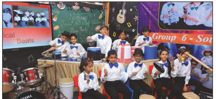
The Symphony of Music