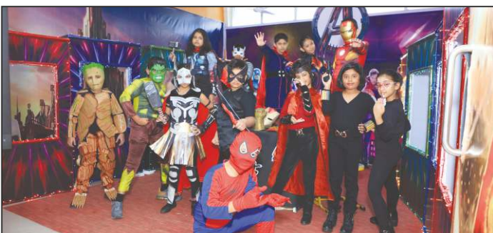
Avengers at NLDHS