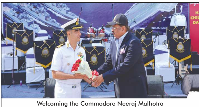
Welcoming the Commodore Neeraj Malhotra