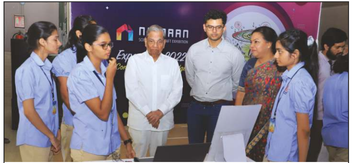
Displaying their Expertise to the Dignitaries