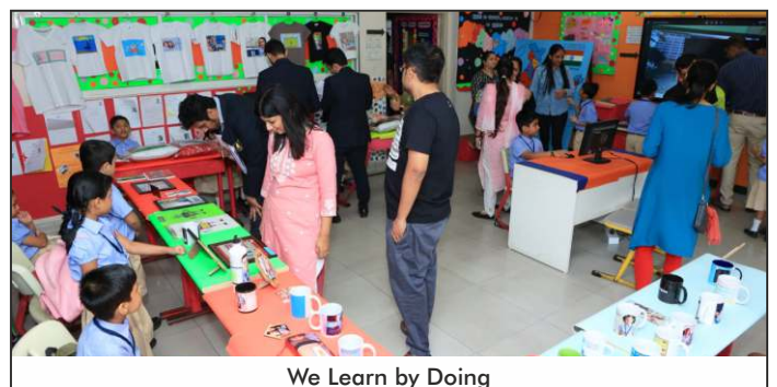
We Learn by Doing