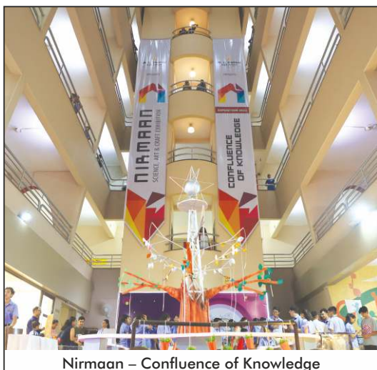
Nirmaan – Confluence of Knowledge