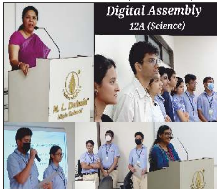
Digital Assembly 12A (Science)