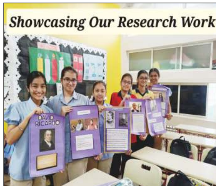
Showcasing Our Research Work