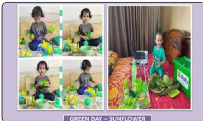
GREEN DAY - SUNFLOWER

The inquisitive minds of tiny toddlers are always attracted to bright colours. Introducing different colours to the toddlers is extremely important as it helps to create a cognitive link between visual clues and words. The students of Sunflower Playschool were introduced to 'Green' colour on 3rd December, 2021. They were given a first-hand experience of identifying Green colour objects. All the students were dressed in green coloured clothes too.