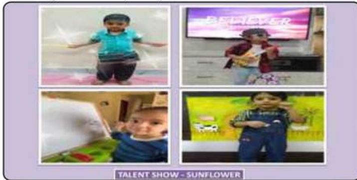
TALENT SHOW - SUNFLOWER

Every child's mind is like a blank canvas; like a soft piece of clay which moulds itself with the passage of time. The formative years, that is the preschool age of every child is extremely vital in giving a strong foundation to the mind of the child. This is the age where the child develops important lifelong personality traits, such as confidence, good manners, sportsmanship, and peaceful co-existence. A child's creativity builds with the help of his/her exposure to the appropriate parts of their environment. It takes form when the child steps out of his/her comfort zone and is encouraged to build a bridge between oneself and the outside world. Therefore, to encourage the child to build his/her confidence, and to bridge the gap between academics and entertainment, the Pre-Primary section of N. L. Dalmia High School conducted the event – 'The Talent Show' on 16th and 17th of December. All the students participated in it, and got a chance to showcase their hidden talent. The students received a lot of appreciation and applaud from their peers and teachers which boosted their confidence and encouraged them to participate in further events too.