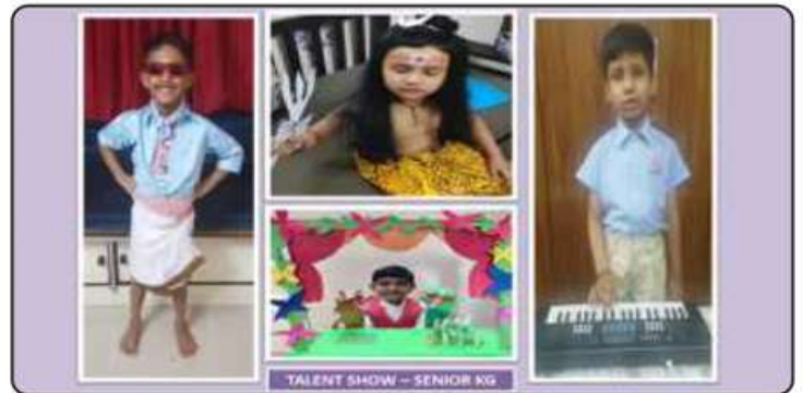
TALENT SHOW - SENIOR KG