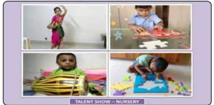
TALENT SHOW - NURSERY