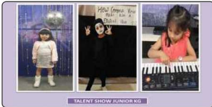
TALENT SHOW JUNIOR KG